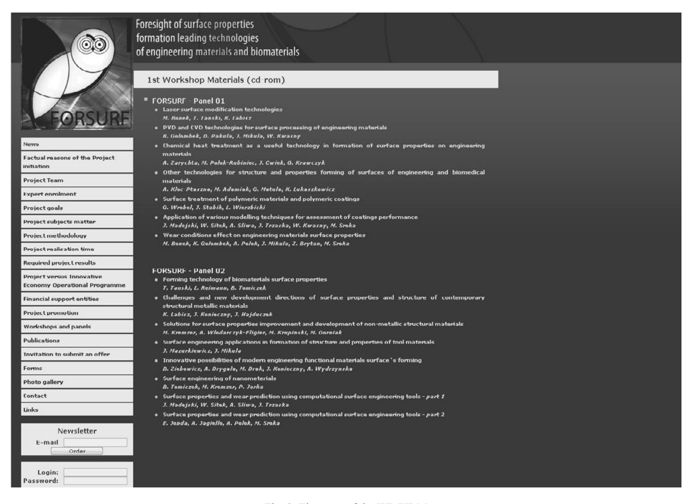
Fig. 3. The page of the WP FIRM